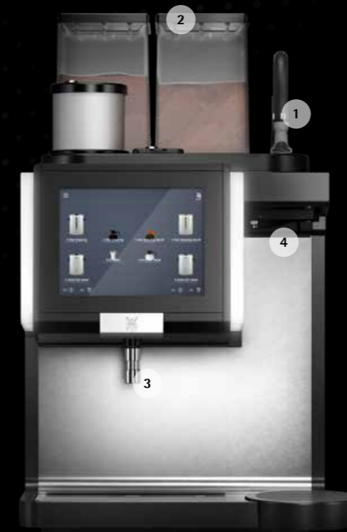
WMF 9000 F (External Storage)

The WMF 9000 F automatic filter coffee machine combines high performance, excellent coffee quality, and user-friendly operation. Each of its two versions offers a variety of innovative features to satisfy the requirements of the mass catering sector as well as high-volume, self-service venues. Naturally, both versions of this fully automated filter coffee machine share the premium materials, advanced technology, and robust construction you expect from WMF, ensuring many years of reliable and profitable service.