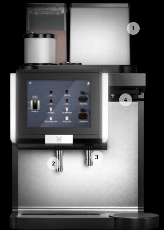
WMF 9000 F (Internal Storage)